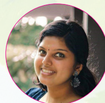
NITHYA V. III DC Malayalam